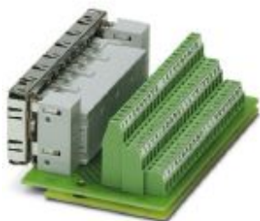
VARIOCON-Interface, with EMC shielding adapter, 32-pos. connector on 2 x 32-pos. screw connection

Please be informed that the data shown in this PDF Document is generated from our Online Catalog. Please find the complete data in the user's documentation. Our General Terms of Use for Downloads are valid ( http://phoenixcontact.com/download )