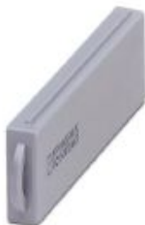
Protective cover, Protective covers, type: VC4, housing material: PA 6, color: gray

Please be informed that the data shown in this PDF Document is generated from our Online Catalog. Please find the complete data in the user's documentation. Our General Terms of Use for Downloads are valid ( http://phoenixcontact.com/download )