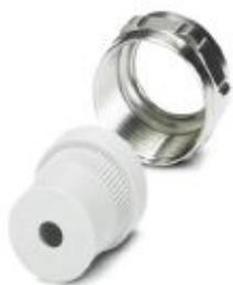
Half screw connection Pg16, made of metal, consisting of rubber seal with one hole and one pressure screw, for type 1 housings, cable [mm] 5 - 8

Please be informed that the data shown in this PDF Document is generated from our Online Catalog. Please find the complete data in the user's documentation. Our General Terms of Use for Downloads are valid ( http://phoenixcontact.com/download )