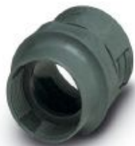
Corrugated tube screw connection, for flexible single wire entry, for connector housings, size Pg21

Please be informed that the data shown in this PDF Document is generated from our Online Catalog. Please find the complete data in the user's documentation. Our General Terms of Use for Downloads are valid ( http://phoenixcontact.com/download )