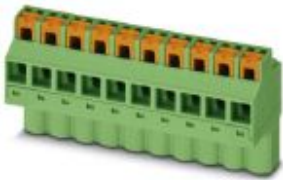
The figure shows a 10-position version

PCB connector, nominal current: 12 A, rated voltage (III/2): 320 V, nominal cross section: 2.5 mm 2 , number of positions: 11, pitch: 5.08 mm, connection method: Push-in spring connection, color: green, contact surface: Tin