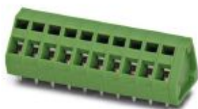
The figure shows an 10-position version

PCB terminal block, nominal current: 16 A, rated voltage (III/2): 400 V, nominal cross section: 1.5 mm 2 , pitch: 5.08 mm, number of positions: 1, connection method: Spring-cage connection, mounting: Wave soldering, conductor/PCB connection direction: 45 °, color: green, Pin layout: Linear double pinning, Solder pin [P]: 3.5 mm. End terminal block for terminating custom-grouped blocks.