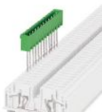
The figure shows a 12-position version

Please be informed that the data shown in this PDF Document is generated from our Online Catalog. Please find the complete data in the user's documentation. Our General Terms of Use for Downloads are valid ( http://phoenixcontact.com/download )