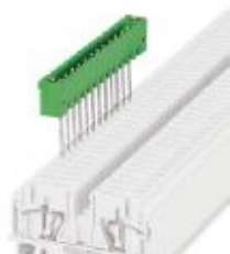
The figure shows a 12-position version

Please be informed that the data shown in this PDF Document is generated from our Online Catalog. Please find the complete data in the user's documentation. Our General Terms of Use for Downloads are valid ( http://phoenixcontact.com/download )