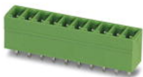
The figure shows the 10-pos. standard item

PCB headers, nominal current: 8 A, number of positions: 4, pitch: 3.81 mm, color: green, contact surface: Tin, mounting: Wave soldering