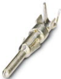
Rolled male contact, single contacts, silver-plated, 1.5 mm 2 ... 2.5 mm 2

Please be informed that the data shown in this PDF Document is generated from our Online Catalog. Please find the complete data in the user's documentation. Our General Terms of Use for Downloads are valid ( http://phoenixcontact.com/download )