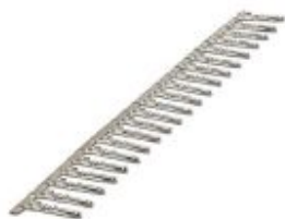
Rolled female contact, taped, silver-plated, 0.5 mm 2 ... 1.5 mm 2 left contact lead-in, 2000 pieces per roll

Please be informed that the data shown in this PDF Document is generated from our Online Catalog. Please find the complete data in the user's documentation. Our General Terms of Use for Downloads are valid ( http://phoenixcontact.com/download )