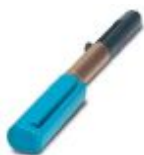
Contact removal tool, for turned and rolled CK- 1.6-... contacts

Contact removal tool - VC-EW 1,6 - 1884869