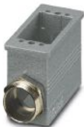
Coupling housing, made of metal, powder-coated type 2, number of modules 3, cable screw connection Pg21

Please be informed that the data shown in this PDF Document is generated from our Online Catalog. Please find the complete data in the user's documentation. Our General Terms of Use for Downloads are valid ( http://phoenixcontact.com/download )