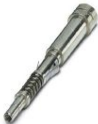
POF fiber optic pin contact, turned, for contact carriers (HC-DD...I-CT.../ HC-M-12-CT-.../ HC-M-17-CT-...) of CK1,6-ED... contacts

Please be informed that the data shown in this PDF Document is generated from our Online Catalog. Please find the complete data in the user's documentation. Our General Terms of Use for Downloads are valid ( http://phoenixcontact.com/download )