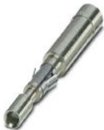
POF fiber optic socket contact, turned, for contact carriers (HC-DD...I-CT.../ HC-M-12-CT-F.../ HC-M-17-CT-F...) of CK1,6-ED... contacts

Please be informed that the data shown in this PDF Document is generated from our Online Catalog. Please find the complete data in the user's documentation. Our General Terms of Use for Downloads are valid ( http://phoenixcontact.com/download )