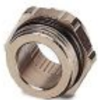
Cable screw connection support Pg16/M25, metal; for thread M25 and rubber seals of size Pg16

Cable gland - VC-M-KV-PG16/M25 ST - 1644407