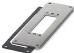
The figure shows version HC-B 24-ADP-VC...

Adapter plates 2 mm thick, for panel cutouts of HC-B 16 size, including 1.5 mm flat gasket, size 1