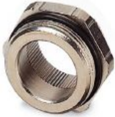
Cable glands for Pg21 half screw connection to Pg21 housing entry, metal

Please be informed that the data shown in this PDF Document is generated from our Online Catalog. Please find the complete data in the user's documentation. Our General Terms of Use for Downloads are valid ( http://phoenixcontact.com/download )