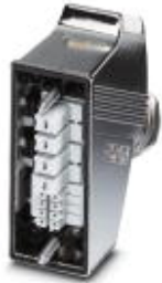
Sleeve housing, made of metal, with EMC coating, in accordance with drawing

Please be informed that the data shown in this PDF Document is generated from our Online Catalog. Please find the complete data in the user's documentation. Our General Terms of Use for Downloads are valid ( http://phoenixcontact.com/download )