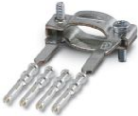
Shield connection for two shielded cables on female contact carriers, without loose crimp contacts

Please be informed that the data shown in this PDF Document is generated from our Online Catalog. Please find the complete data in the user's documentation. Our General Terms of Use for Downloads are valid ( http://phoenixcontact.com/download )