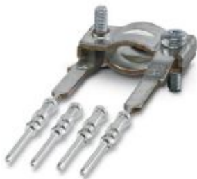
Shield connection, for a shielded line on male contact carriers, incl. two loose crimp contacts for PROFIBUS line

Please be informed that the data shown in this PDF Document is generated from our Online Catalog. Please find the complete data in the user's documentation. Our General Terms of Use for Downloads are valid ( http://phoenixcontact.com/download )