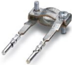
Shield connection for one shielded cable on female contact carriers, without loose crimp contacts

Please be informed that the data shown in this PDF Document is generated from our Online Catalog. Please find the complete data in the user's documentation. Our General Terms of Use for Downloads are valid ( http://phoenixcontact.com/download )