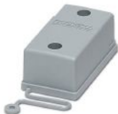
Protective cover, Protective covers, type: VC2, housing material: PA 6, color: gray

Please be informed that the data shown in this PDF Document is generated from our Online Catalog. Please find the complete data in the user's documentation. Our General Terms of Use for Downloads are valid ( http://phoenixcontact.com/download )