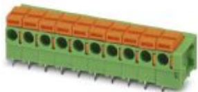
The figure shows the 10-position version

PCB terminal block, nominal current: 15 A, rated voltage (III/2): 400 V, nominal cross section: 1.5 mm 2 , pitch: 5.08 mm, number of positions: 8, connection method: Push-in spring connection, mounting: Wave soldering, conductor/PCB connection direction: 0 °, color: green, Pin layout: Linear double pinning, Solder pin [P]: 3.4 mm