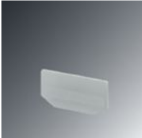
End cover, length: 68 mm, width: 2.2 mm, height: 34 mm, color: gray

Please be informed that the data shown in this PDF Document is generated from our Online Catalog. Please find the complete data in the user's documentation. Our General Terms of Use for Downloads are valid ( http://phoenixcontact.com/download )