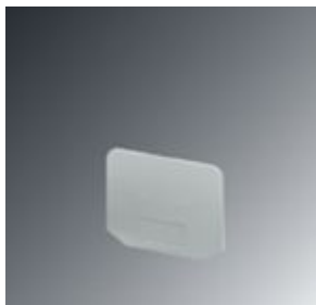
End cover, width: 2.3 mm, color: gray

Please be informed that the data shown in this PDF Document is generated from our Online Catalog. Please find the complete data in the user's documentation. Our General Terms of Use for Downloads are valid ( http://phoenixcontact.com/download )