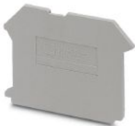
End cover, length: 50 mm, width: 2 mm, height: 36 mm, color: gray

Please be informed that the data shown in this PDF Document is generated from our Online Catalog. Please find the complete data in the user's documentation. Our General Terms of Use for Downloads are valid ( http://phoenixcontact.com/download )