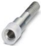
Female test connector, color: silver

Female test connector - PSBJ 3/13/4 - 0201304