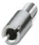
Female test connector, color: silver

Female test connector - PSB 3/10/4 - 0601292