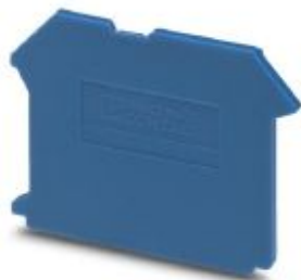
End cover, length: 50.5 mm, width: 2 mm, height: 47 mm, color: blue

Please be informed that the data shown in this PDF Document is generated from our Online Catalog. Please find the complete data in the user's documentation. Our General Terms of Use for Downloads are valid ( http://phoenixcontact.com/download )