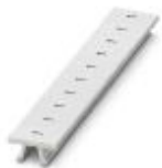
Zack marker strip, Strip, white, labeled, can be labeled with: CMS-P1-PLOTTER, printed horizontally: Identical numbers 1 or 2, etc. up to 100, mounting type: snap into tall marker groove, for terminal block width: 6.2 mm, lettering field size: 6.15 x 10.5 mm, Number of individual labels: 10

Zack marker strip - ZB 6,LGS:GLEICHE ZAHLEN - 1051032