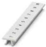
Zack marker strip, Strip, white, labeled, can be labeled with: CMS-P1-PLOTTER, printed horizontally: consecutive numbers 1 ... 10, 11 ... 20, etc. up to 491 ... 500, mounting type: snap into tall marker groove, for terminal block width: 6.2 mm, lettering field size: 6.15 x 10.5 mm, Number of individual labels: 10

Zack marker strip - ZB 6,LGS:FORTL.ZAHLEN - 1051016