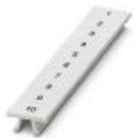
Zack marker strip, Strip, white, labeled, can be labeled with: CMS-P1-PLOTTER, Printed vertically: consecutive numbers 1 ... 10, 11 ... 20, etc. up to 491 ... 500, mounting type: snap into tall marker groove, for terminal block width: 6.2 mm, lettering field size: 6.15 x 10.5 mm, Number of individual labels: 10

Zack marker strip - ZB 6,QR:FORTL.ZAHLEN - 1051029