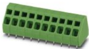
The figure shows the 10-pos. standard item

PCB terminal block, nominal current: 24 A, rated voltage (III/2): 400 V, nominal cross section: 2.5 mm 2 , pitch: 5.08 mm, number of positions: 10, connection method: Spring-cage connection, mounting: Wave soldering, conductor/PCB connection direction: 45 °, color: green, Pin layout: Linear double pinning, Solder pin [P]: 3.5 mm