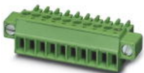
The figure shows a 10-position version of the product

PCB connector, nominal current: 8 A, number of positions: 6, pitch: 3.5 mm, connection method: Screw connection with tension sleeve, color: black, contact surface: Tin