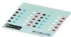
Marker card, Card, white, labeled, mounting type: adhesive, for terminal block width: 5.08 mm

Please be informed that the data shown in this PDF Document is generated from our Online Catalog. Please find the complete data in the user's documentation. Our General Terms of Use for Downloads are valid ( http://phoenixcontact.com/download )