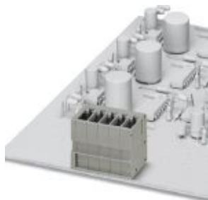
ST-COMBI receptacle, plug-in direction vertical to the PCB, pitch: 5.2 mm, no. of positions: 6

Please be informed that the data shown in this PDF Document is generated from our Online Catalog. Please find the complete data in the user's documentation. Our General Terms of Use for Downloads are valid ( http://phoenixcontact.com/download )