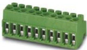
The figure shows a 10-position version of the product

PCB connector, nominal current: 6 A, rated voltage (III/2): 200 V, nominal cross section: 1.5 mm 2 , number of positions: 7, pitch: 3.5 mm, connection method: Screw connection with wire protector, color: green, contact surface: Tin