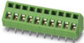
The figure shows an 10-position version

PCB terminal block, nominal current: 16 A, rated voltage (III/2): 400 V, nominal cross section: 1.5 mm 2 , pitch: 5 mm, number of positions: 3, connection method: Spring-cage connection, mounting: Wave soldering, conductor/PCB connection direction: 45 °, color: multi-color, Pin layout: Linear double pinning, Solder pin [P]: 3.5 mm