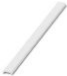
Zack Marker strip, flat, Strip, white, unlabeled, can be labeled with: CMS-P1-PLOTTER, PLOTMARK, mounting type: snap into flat marker groove, for terminal block width: 10 mm, lettering field size: 5.15 x 10 mm, Number of individual labels: 10

Zack Marker strip, flat - ZBF10:UNBEDRUCKT - 0809997