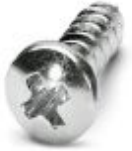
Screw set for DFK-PC 16... connectors