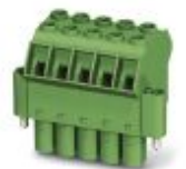
PCB connector, nominal current: 76 A, rated voltage (III/2): 1000 V, nominal cross section: 16 mm 2 , number of positions: 6, pitch: 10.16 mm, connection method: Screw connection with tension sleeve, color: green, contact surface: Silver

Printed-circuit board connector - TPC 16/ 6-STF-10,16 - 1715293