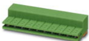
The figure shows an 10-position version

PCB direct plug, nominal current: 10 A, number of positions: 5, pitch: 7.5 mm, connection method: Spring-cage connection, color: green, contact surface: Tin, mounting: Direct plug-in method