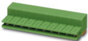
The figure shows an 10-position version

PCB direct plug, nominal current: 10 A, number of positions: 4, pitch: 7.5 mm, connection method: Spring-cage connection, color: green, contact surface: Tin, mounting: Direct plug-in method