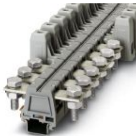
Universal terminal block with bolt connection, cross section: 25 ... 50 mm 2 , AWG: 6 ... 1/0, width: 32 mm, color: gray

Please be informed that the data shown in this PDF Document is generated from our Online Catalog. Please find the complete data in the user's documentation. Our General Terms of Use for Downloads are valid ( http://phoenixcontact.com/download )