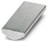
Insertion profile, color: silver