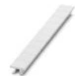
Zack marker strip, Strip, white, unlabeled, can be labeled with: PLOTMARK, CMS-P1-PLOTTER, mounting type: snap into tall marker groove, for terminal block width: 10.2 mm, lettering field size: 10.5 x 10.15 mm, Number of individual labels: 10

Zack marker strip - ZB 10:UNBEDRUCKT - 1053001