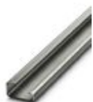
DIN rail, unperforated, G profile, width: 32 mm, height: 15 mm, acc. to EN 60715, material: Steel, galvanized, passivated with a thick layer, length: 2000 mm, color: silver

DIN rail, unperforated - NS 32 UNPERF 2000MM - 1201015