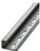
DIN rail perforated, G profile, width: 32 mm, height: 15 mm, acc. to EN 60715, material: Steel, galvanized, passivated with a thick layer, length: 2000 mm, color: silver

DIN rail perforated - NS 32 PERF 2000MM - 1201002