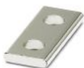
Connection rail, number of positions: 2, color: silver