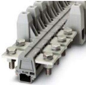
Universal terminal block with bolt connection, cross section: 50 ... 150 mm 2 , width: 46 mm, color: gray

Please be informed that the data shown in this PDF Document is generated from our Online Catalog. Please find the complete data in the user's documentation. Our General Terms of Use for Downloads are valid ( http://phoenixcontact.com/download )