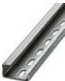
DIN rail perforated, G profile, width: 32 mm, height: 15 mm, acc. to EN 60715, material: Steel, galvanized, passivated with a thick layer, length: 2000 mm, color: silver

DIN rail perforated - NS 32 PERF 2000MM - 1201002