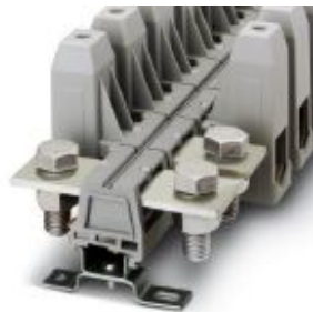
Universal terminal block with bolt connection, cross section: 70 ... 240 mm 2 , width: 53 mm, color: gray

Please be informed that the data shown in this PDF Document is generated from our Online Catalog. Please find the complete data in the user's documentation. Our General Terms of Use for Downloads are valid ( http://phoenixcontact.com/download )