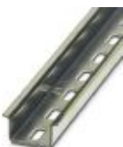
DIN rail perforated, Standard profile, width: 35 mm, height: 15 mm, similar to EN 60715, material: Steel, galvanized, passivated with a thick layer, length: 2000 mm, color: silver

DIN rail perforated - NS 35/15 PERF 2000MM - 1201730