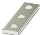
Connection rail, number of positions: 3, color: silver