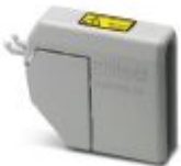
Covering hood, length: 137.4 mm, width: 49.8 mm, height: 77 mm, color: gray