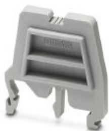
Flange cover, length: 43.3 mm, width: 5.2 mm, color: gray

Please be informed that the data shown in this PDF Document is generated from our Online Catalog. Please find the complete data in the user's documentation. Our General Terms of Use for Downloads are valid ( http://phoenixcontact.com/download )