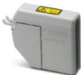
Covering hood, length: 91 mm, width: 28.8 mm, height: 59 mm, color: gray

Please be informed that the data shown in this PDF Document is generated from our Online Catalog. Please find the complete data in the user's documentation. Our General Terms of Use for Downloads are valid ( http://phoenixcontact.com/download )