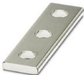
Connection rail, number of positions: 3, color: silver

Please be informed that the data shown in this PDF Document is generated from our Online Catalog. Please find the complete data in the user's documentation. Our General Terms of Use for Downloads are valid ( http://phoenixcontact.com/download )