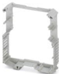
Complete housing, length: 99 mm, Central part, color: light gray, width: 22.5 mm

Please be informed that the data shown in this PDF Document is generated from our Online Catalog. Please find the complete data in the user's documentation. Our General Terms of Use for Downloads are valid ( http://phoenixcontact.com/download )