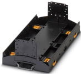
Installation component housing, length: 89.7 mm, with vents, Lower part, Cross connection: DIN rail bus connector, color: black, width: 161.6 mm, height: 49 mm, number of positions cross connector: 16

Please be informed that the data shown in this PDF Document is generated from our Online Catalog. Please find the complete data in the user's documentation. Our General Terms of Use for Downloads are valid ( http://phoenixcontact.com/download )