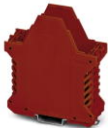
Component housing, length: 99 mm, with vents, Lower part, color: red, width: 35 mm, height: 114.5 mm

Please be informed that the data shown in this PDF Document is generated from our Online Catalog. Please find the complete data in the user's documentation. Our General Terms of Use for Downloads are valid ( http://phoenixcontact.com/download )