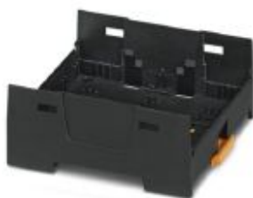
DIN rail housing, Lower housing part with base latch, flat design, width: 67.6 mm, height: 75 mm, depth: 30.3 mm, color: black (9005)

Please be informed that the data shown in this PDF Document is generated from our Online Catalog. Please find the complete data in the user's documentation. Our General Terms of Use for Downloads are valid ( http://phoenixcontact.com/download )